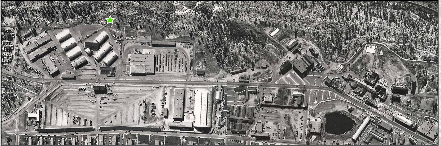
★ Legacy outfall cleanup site