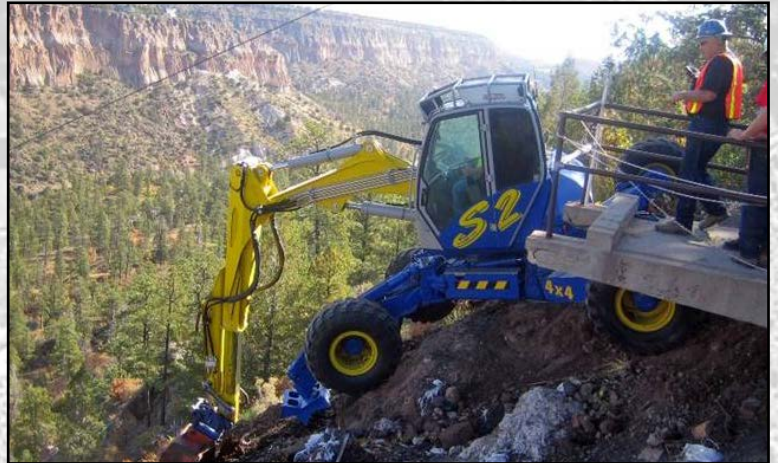
Crews are using a spider excavator, similar to the one used for a cleanup at the Los Alamos County airport (above) in 2013, to excavate soil from the steep slopes of the canyon side.

Before leaving the site, experts will evaluate results of confirmatory samples to ensure that the cleanup is complete. Once the cleanup is completed, crews will restore the site.