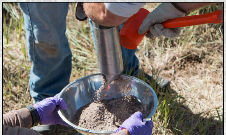
Experts analyze results of confirmation samples from around cleanup sites to ensure that all contamination is removed in compliance with NMED regulations.