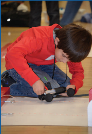
Participant in the 2013 Hydrogen Fuel Cell Challenge