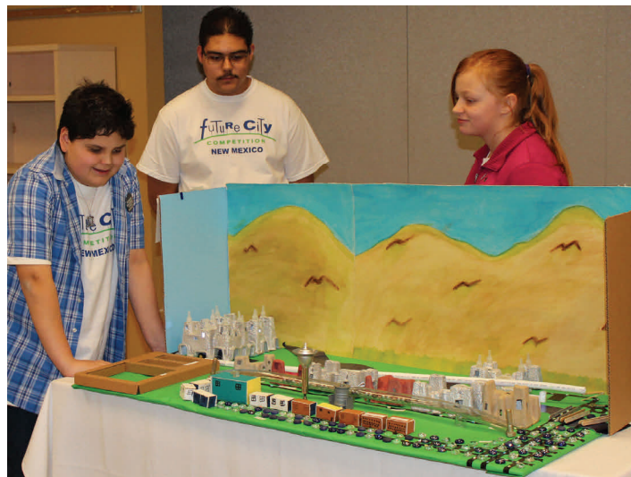
Taos Middle School captured the best presentation award in the Future City Competition.

For more information, go to http://community.lanl.gov